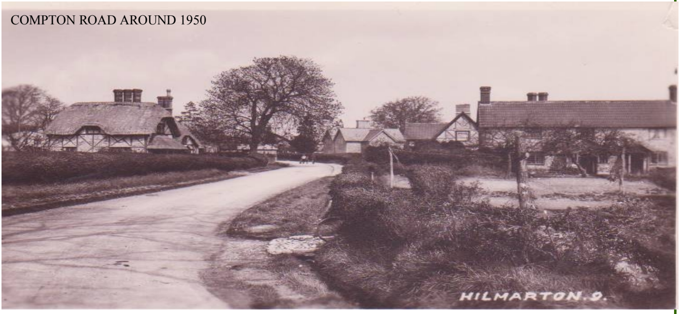
COMPTON ROAD AROUND 1950